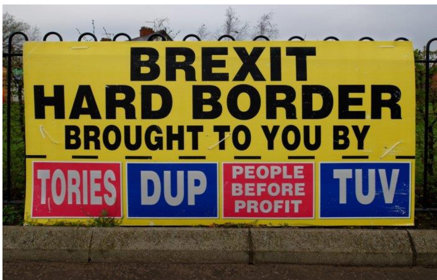
Anti-Brexit Nationalist placard, Anderstown, Belfast.

Northern Ireland. According to political observers and public opinion alike, the open border between Ulster and Éire has played a key part in the peace process due to a threefold positive impact. First, from an economic point of view, the open border has reinforced trade relations between the two Irelands, to the point that the Republic is now Ulster's first economic partner. Second, the disappearance of border controls has ended not only to a climate of generalised suspicion, but also Northern Ireland's cultural isolation. Third, calls to violent action are on the wane, as both Catholics and Protestants are now largely keen on keeping the peace and moving on from the Troubles. 7 Yet Brexit might very well shatter this fragile balance.