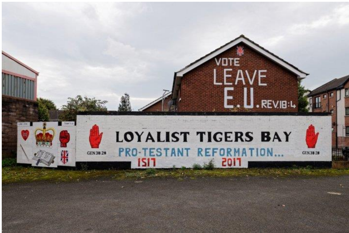
A pro-Brexit Loyalist mural, Tigers Bay, Belfast.